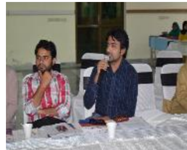
Question Answer Session