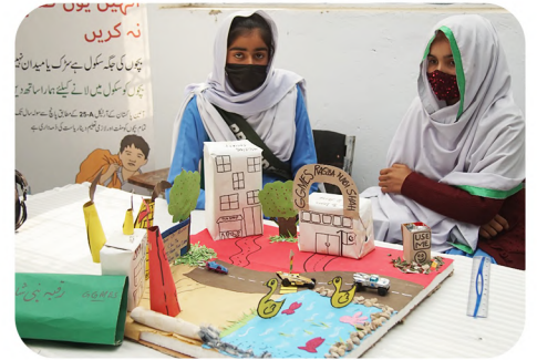
STEM Competition held in DEAs DG Khan & Rajanpur. Laptops, trophies and prizes awarded to the winners.