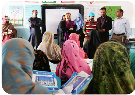
Communication Team-UNICEF visited ALP center Imrana Abad District DG Khan to document Case Study.