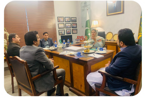
Meeting with Chairperson and Director General, CP&WB Punjab, to collaborate with Child Protection & Welfare Bureau Punjab.