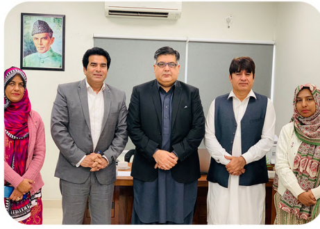
Sanjh Preet team met and briefed the Director PPDU on progress made on enrolment of OOSC in target UCs of ICT.