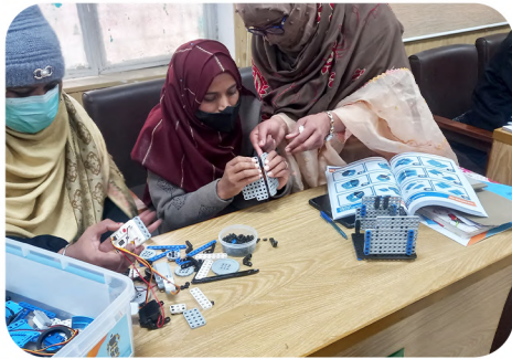
6 Days Teachers Training on STEAM EDUCATION (Discovery & Innovation Labs), DG Khan.