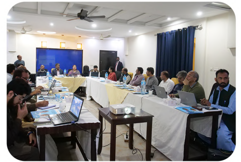
Project Review Meeting with UNICEF on Flood Emergency Program.