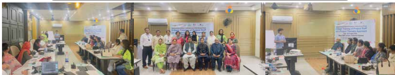
2 Days Training of Project Staff on Project Thematic Approach in Khanewal