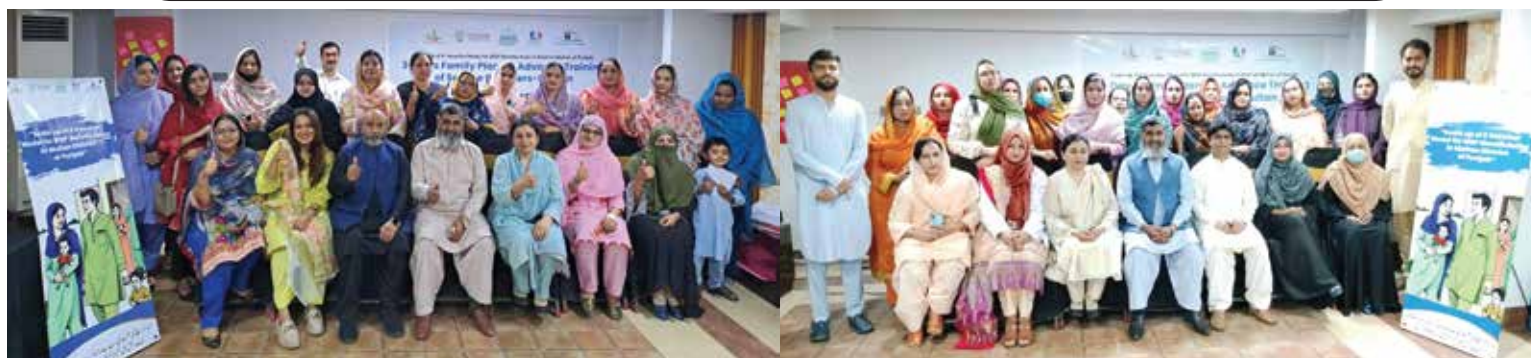
3 Days Family Planning Advance Training of Service Providers Khanewal & Multan