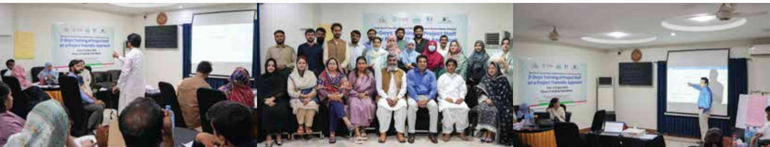
2 Days Training of Project Staff on Project Thematic Approach in Multan

The project aims to improve access to family planning services for Benazir Income Support Programme (BISP) beneficiaries. Through an e-voucher system, it provides free and easy access to reproductive health services from approved healthcare providers. The project focuses on improving maternal and child health, empowering women to make informed decisions, and building partnerships for sustainable population management solutions in Punjab.