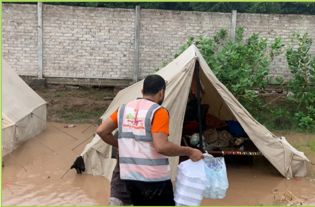
A Sanjh Preet volunteer is providing cooked food to flood affected in District Multan