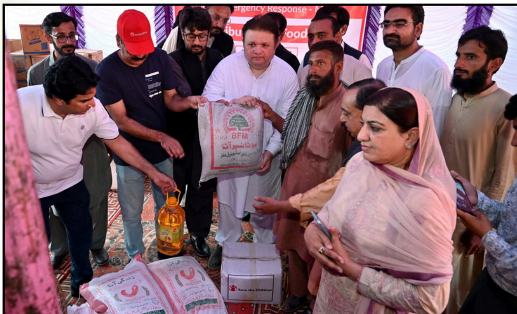
Flood-affected families in district Multan receiving food packs from Chief Secretary Punjab