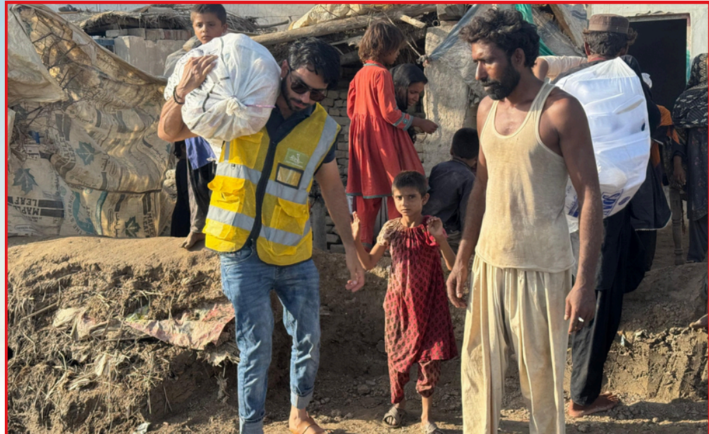
A volunteer is carrying food packs to flood affectees in district Bahawalpur